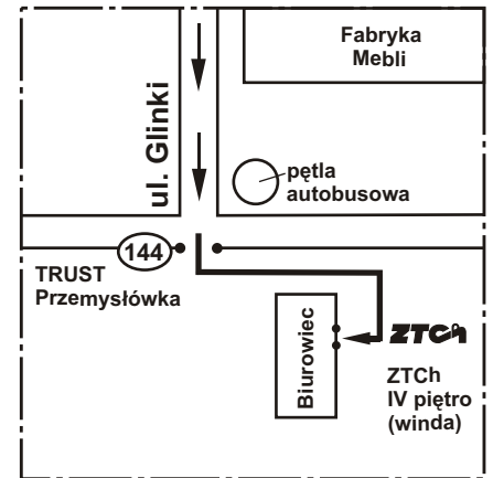
ZTCh ul. Glinki 144